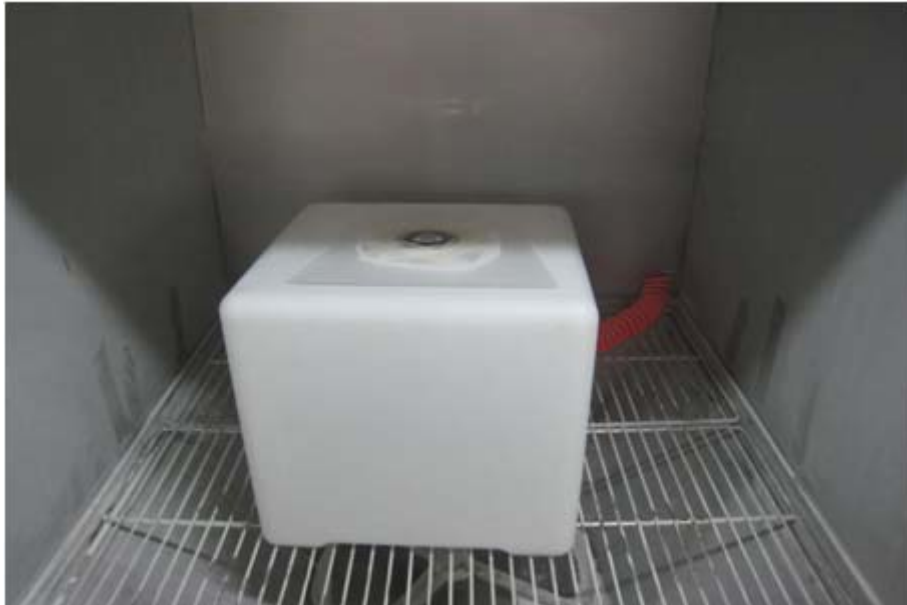
Photo 3 IP6Y Test